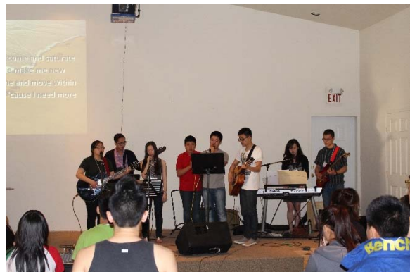
EVMC English Ministry Worship Team