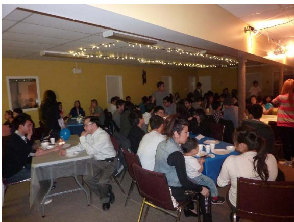
Some of the seventy guests at Easter Café

This Easter Café was a challenge to host but it provided our fellowship with a great opportunity to learn to work together and to use their gifts