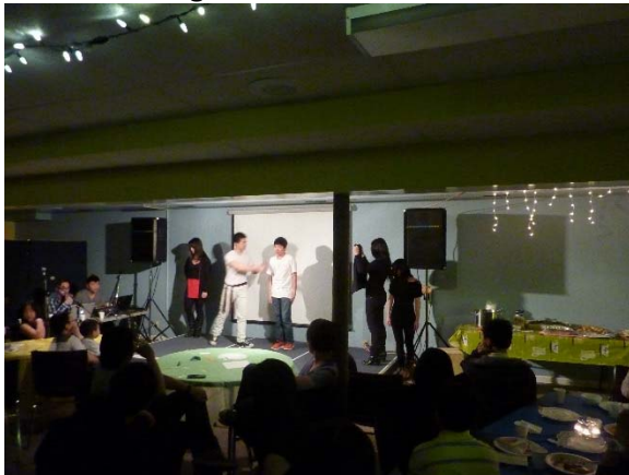
Drime: "Redeemer" presented by our youth group